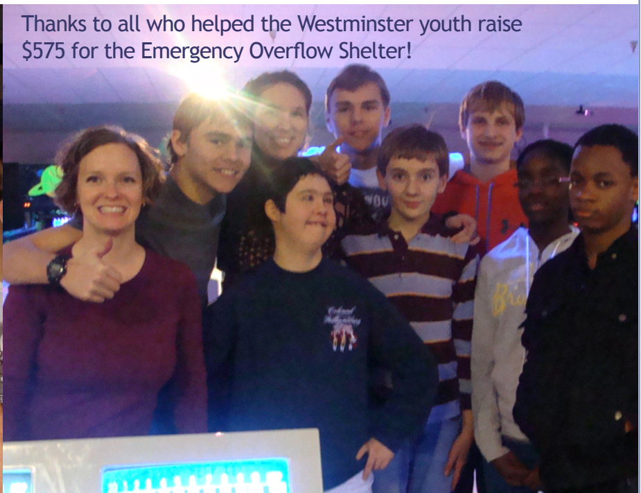
Thanks to all who helped the Westminster youth raise $575 for the Emergency Overflow Shelter!