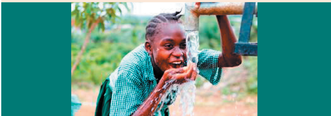
Girl at Hope Mission School Water Pump, Paynesville, Liberia