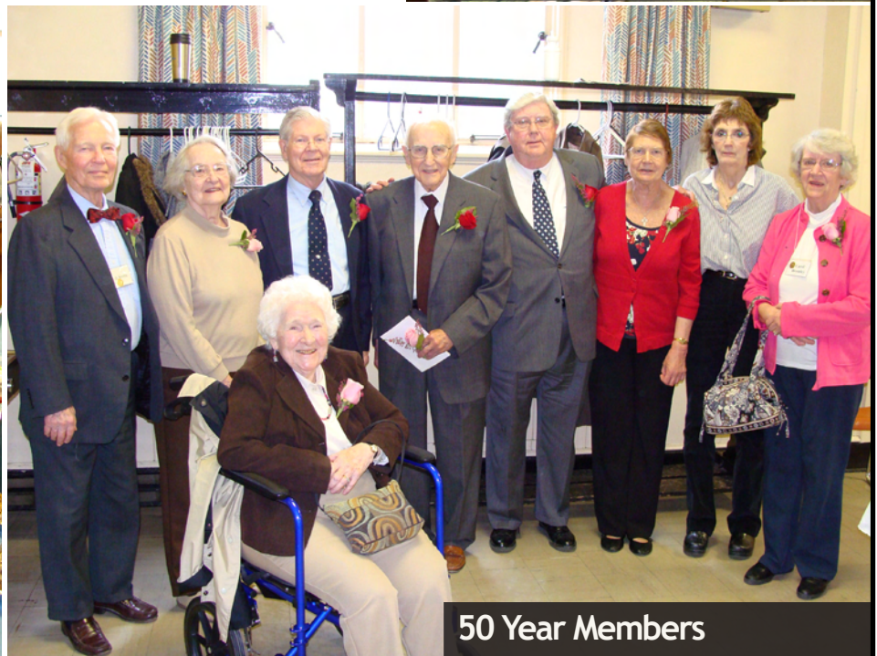
50 Year Members