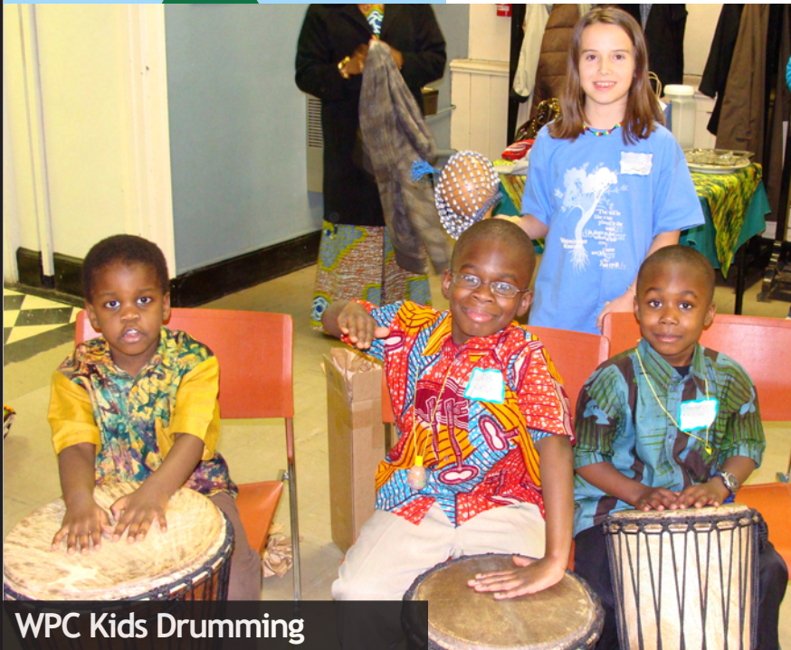
WPC Kids Drumming

Westminster will have a report from FACE Africa, documented by photographs and video, in early May. With funds dedicated to the Liberian Clean Water Fund and for the Hope Mission School in the Committee on Ghana budget, the water committee expects to have about $2,500 on hand as of mid-May. Additional donations may be sent to Westminster Presbyterian Church, memo: Liberian Clean Water Fund ●