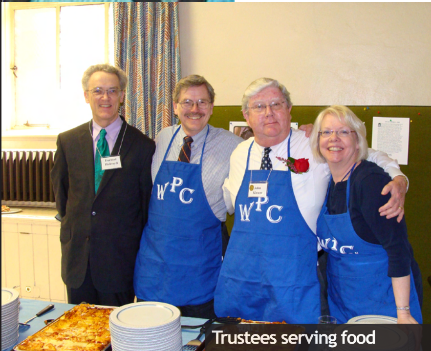
Trustees serving food

Other projects in planning include cleaning the pews and slate floors, replacing curtains, and improving the gardens. These don't cost very much, but greatly improve the church's appearance. And watch for a new color copier. That should arrive some time in May ●