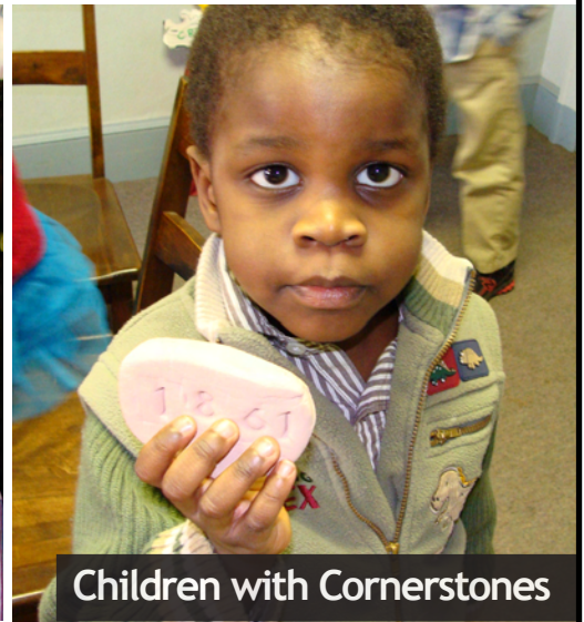
Children with Cornerstones