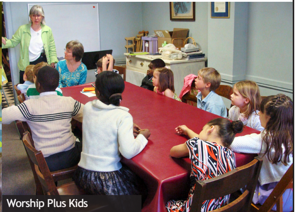
Worship Plus Kids