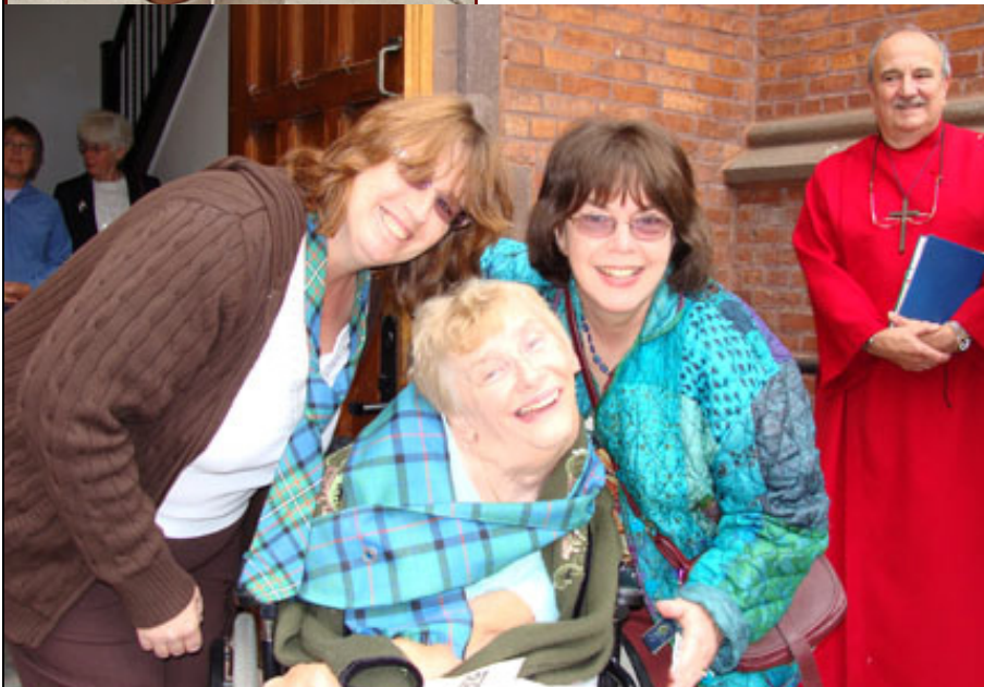
Everyone is Scottish on Kirkin' Sunday