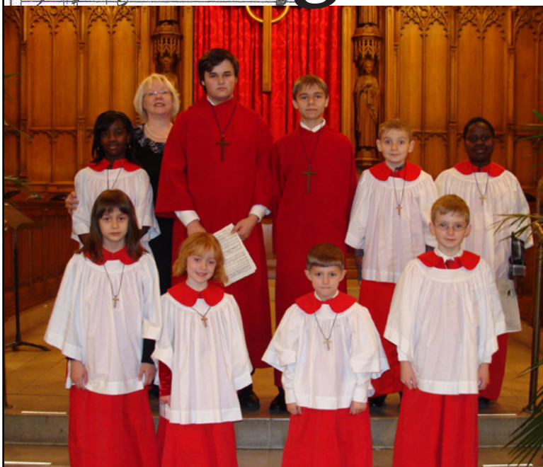
Children’s Choir at Westminster

Singing, musical games, choir chimes, smiles! All these things are shared at Children’s Choir on Thursday evenings. All children and youth, ages 4 on up to 17, are encouraged to share their talents with their church family by attending rehearsals from 6:30 to 7:15 pm. We will be singing in November and for the pageant on Dec. 18. Also, older teens are welcome to help out! Hope to see everyone on October 6 at 6:30 promptly.