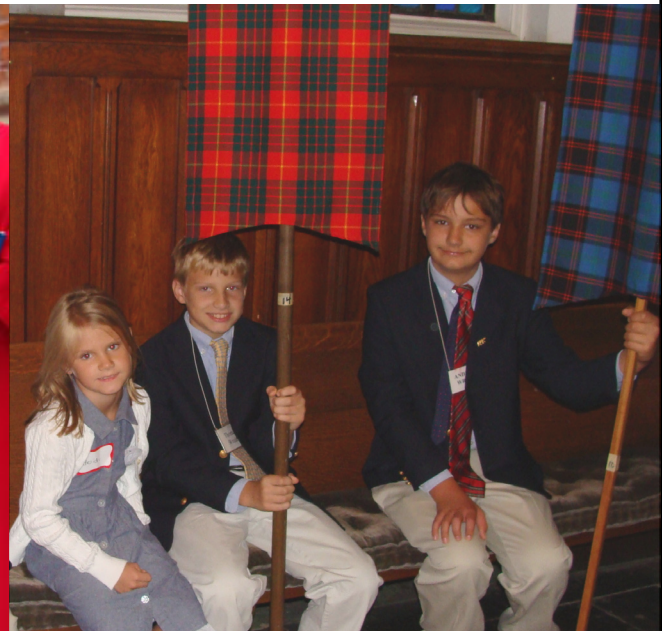
Waiting for the Parade of Tartans