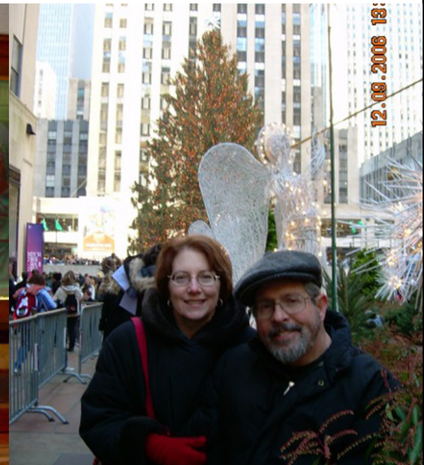
... and at Rockefeller Center