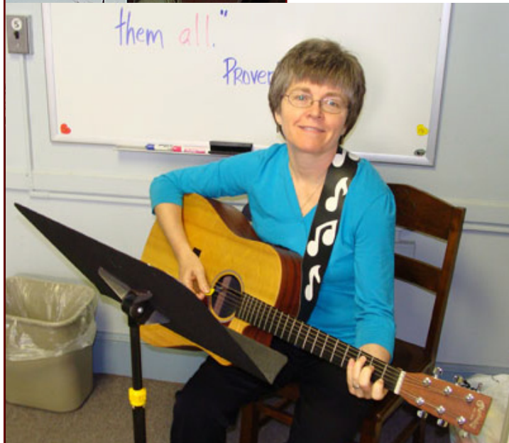
Worship Plus for Kids is starting back up

Worship Plus for Kids is starting back up on September 25th. Kids in pre-K through 5th grade can get a break from the Worship Service and come downstairs for singing, praying, a Bible lesson and a fun learning activity while your parents listen to the sermon ●