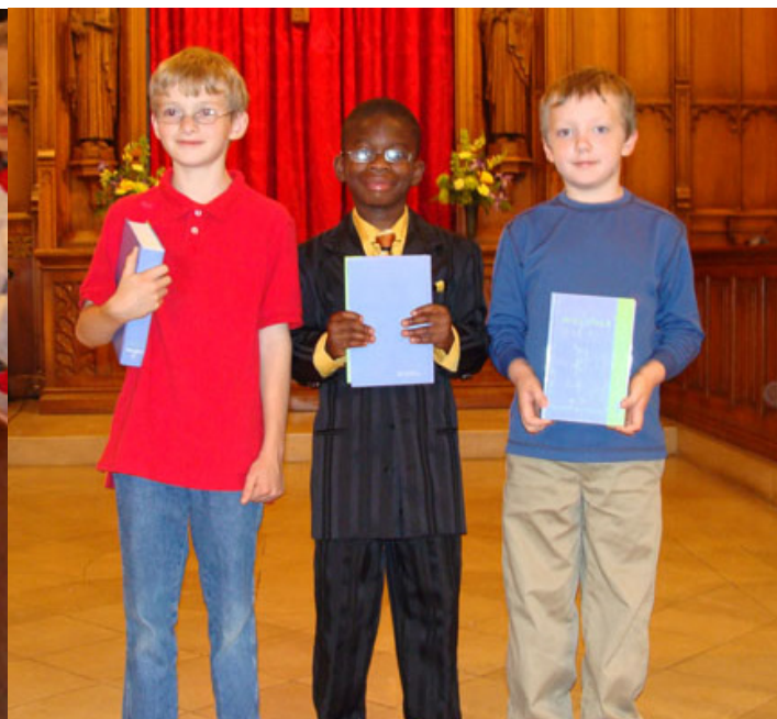
Fourth Graders with their new Bibles.