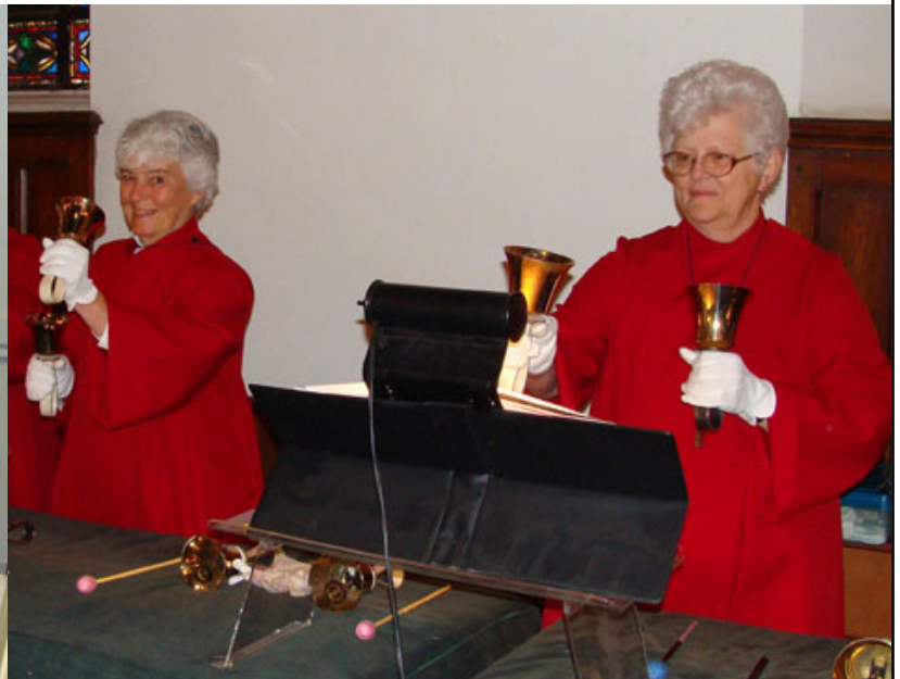
Westminstrels During Worship