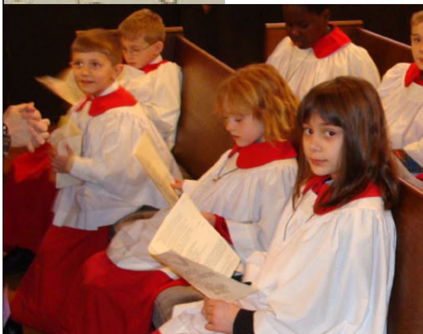
We can't wait to sing again!