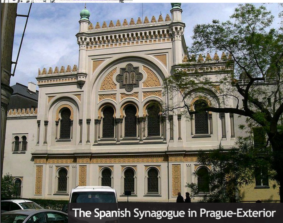
The Spanish Synagogue in Prague-Exterior