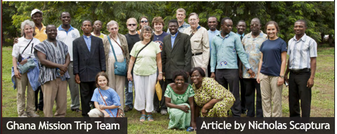
Ghana Mission Trip Team

There were however, some interesting changes. In Accra, particularly, new buildings are beginning to take form against the African sky, a testament to extensive economic expansion. Rather than the more traditional concrete structures commonly seen in Ghana, these behemoths were of western steel construction, complete with plate glass exteriors. The modernity of these buildings contrasts sharply with the buildings standing next to them, and even more so with construction in the rural villages, where mud brick and thatch roof are commonplace. That is not to say that the essence of Ghana was disappearing: in fact the opposite was true. The buildings seemed to say that this is the new Ghana, a rising economic power, leading the way for other African nations in power and stability. (this article continues on page 3)