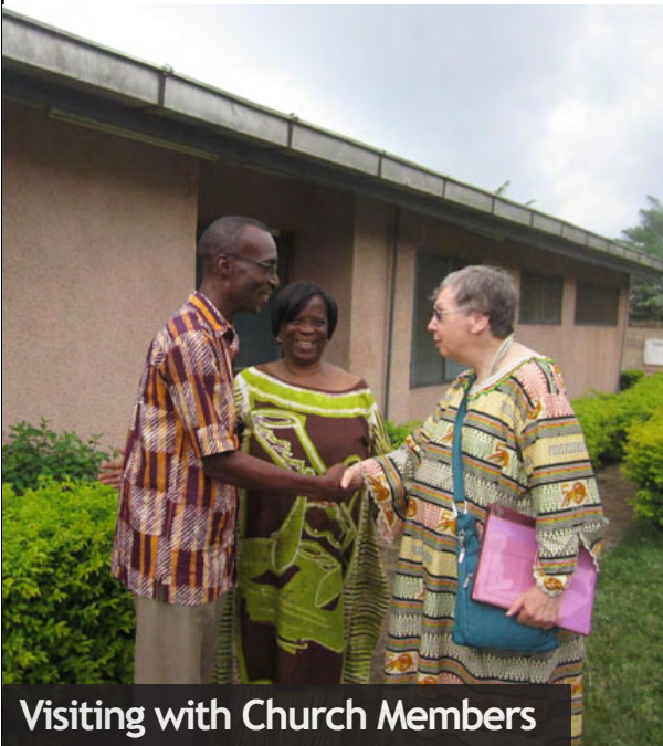
Visiting with Church Members