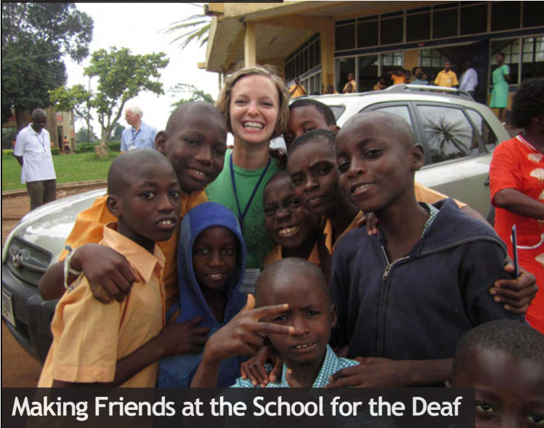
Making Friends at the School for the Deaf

(continued from page 1) In the four years between my visits, Ghana has become a true African success story, though there is more left to be done. Poverty still exists, malaria is still endemic, and clean water continues to be a luxury for most of the country, particularly in the north, to where much of the new wealth will not soon spread. My awe at the speed of this growth is tempered by the knowledge that the influx of wealth does not always mean a bright future for a country. Growth must be free of corruption and greed and properly managed by responsible leaders to benefit the nation. The people of Ghana must rise to the occasion and unite in a desire for the common good by respecting the democratic process that is so hard won in many other nations. They must ensure that those in power act responsibly and effectively to ensure continued prosperity ●